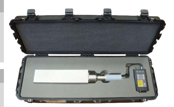
Highly sensitive gamma radiation monitor: BDKG-28 (1 unit)